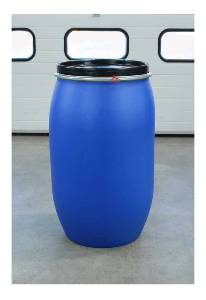
Large MAUSER - plastic - 200 litre