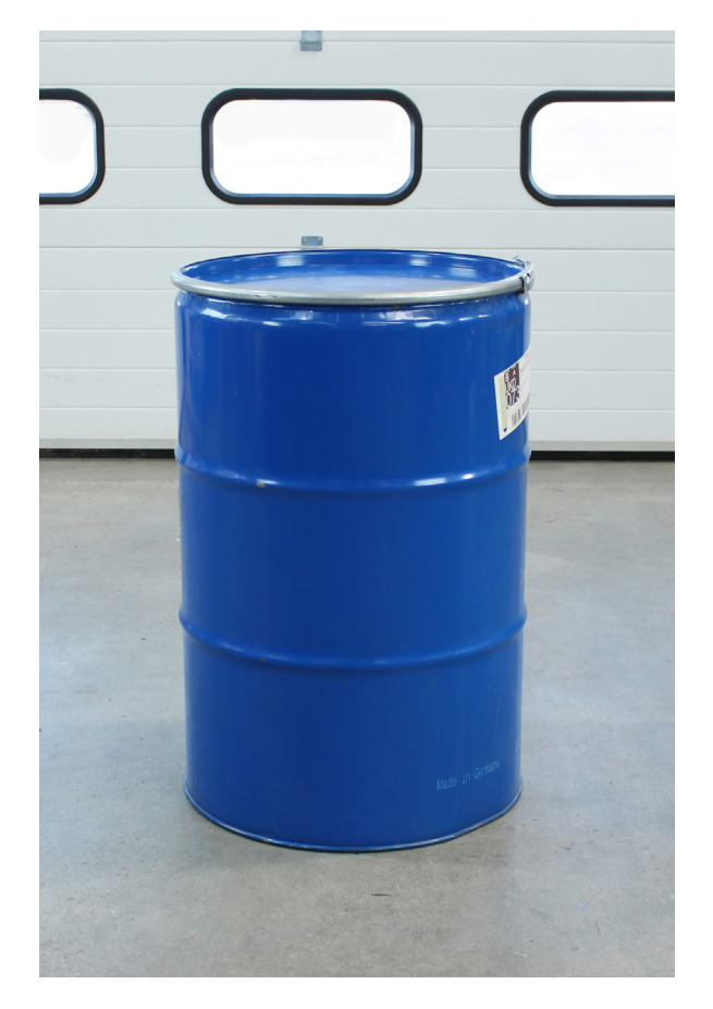
Open-top tapered-lip - steel - 200 litre