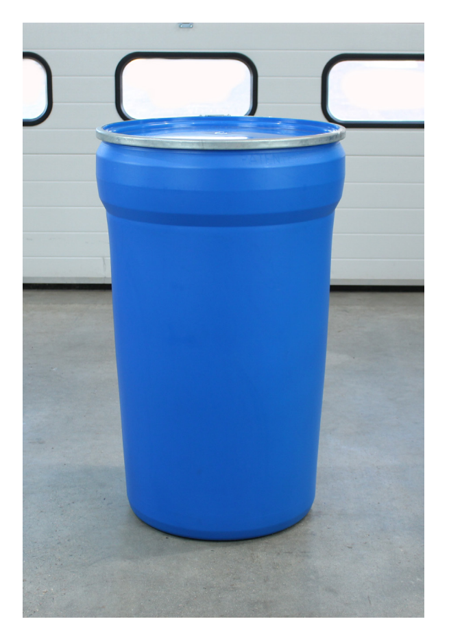
Open-top tapered - plastic - 200 litre