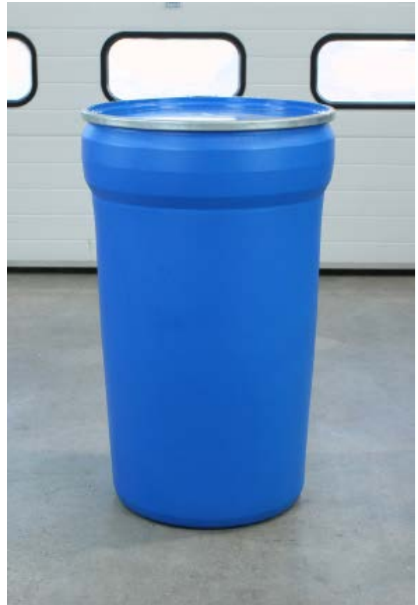
Open-top tapered - plastic - 200 litre