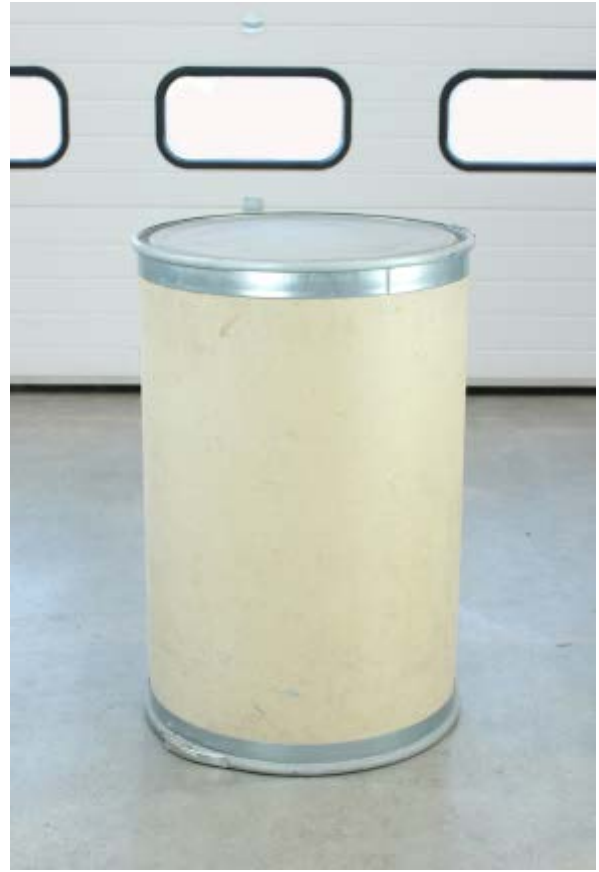
Open-top - cardboard - 200 litre