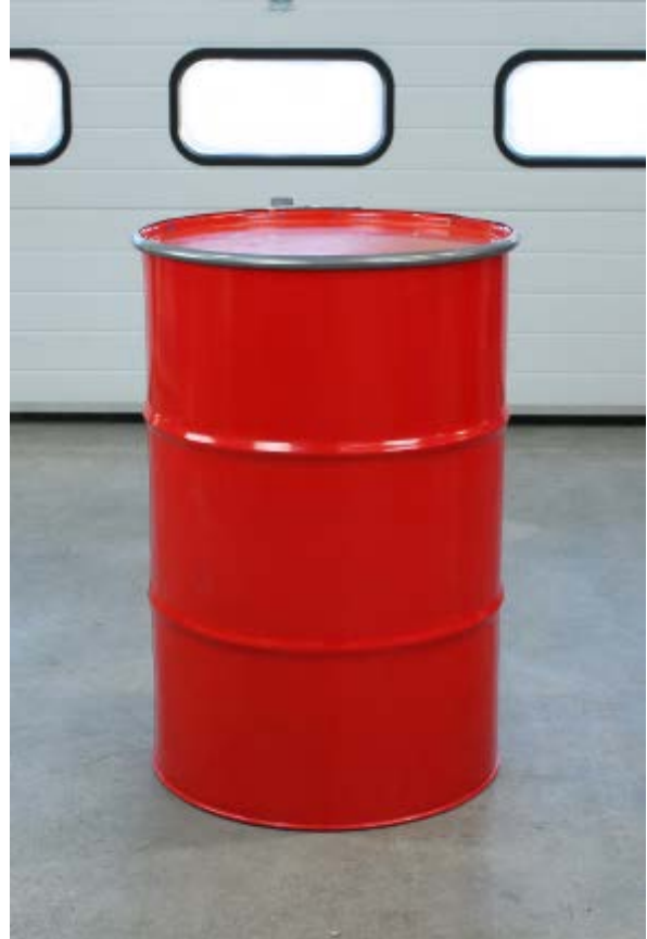
Open-top - steel - 200 litre