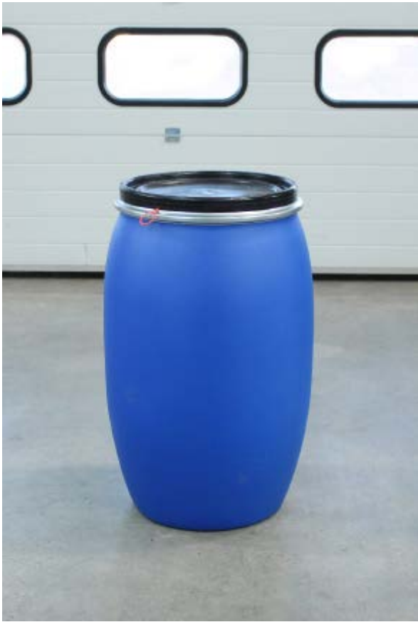
Medium MAUSER - plastic - 120 litre