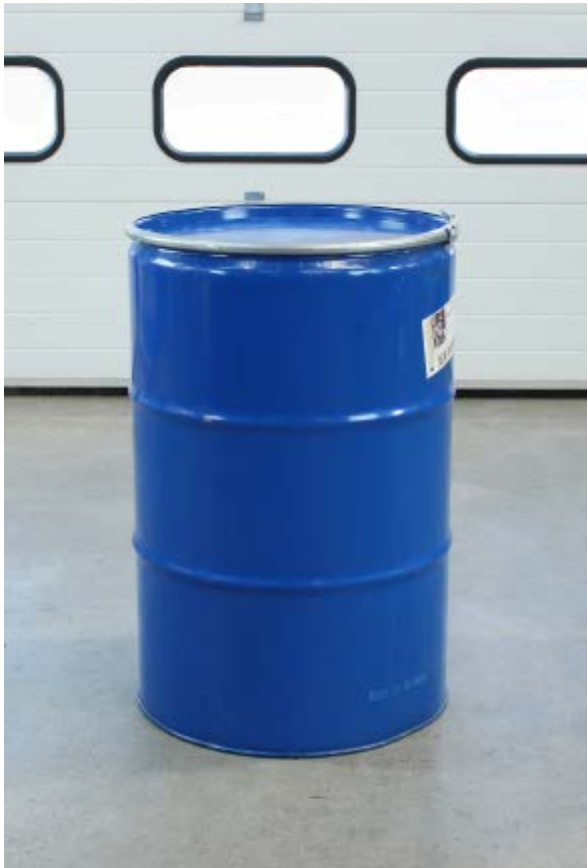
Open-top tapered-lip - steel - 200 litre