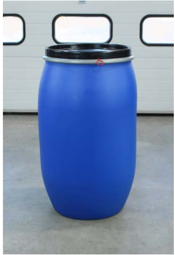
Large MAUSER - plastic - 200 litre