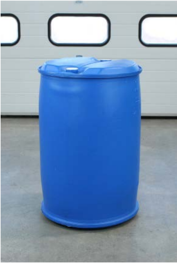
L-ring - plastic - 200 litre