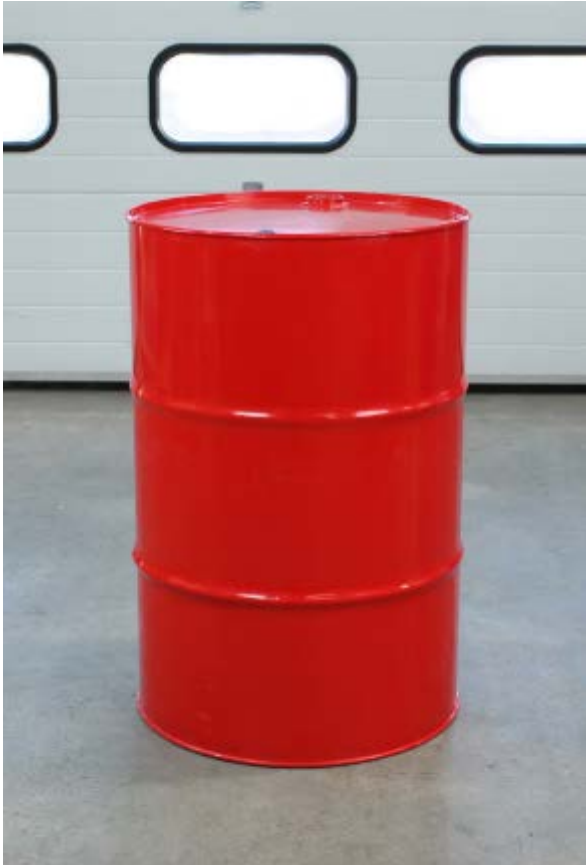
Tight-head - steel - 200 litre