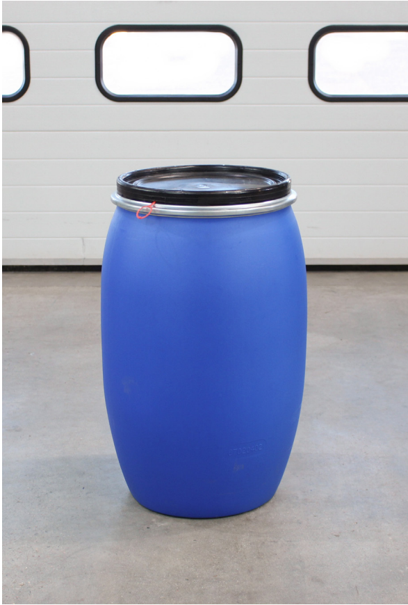
Medium MAUSER - plastic - 120 litre