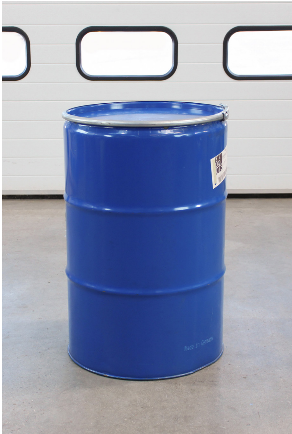
Open-top tapered-lip - steel - 200 litre