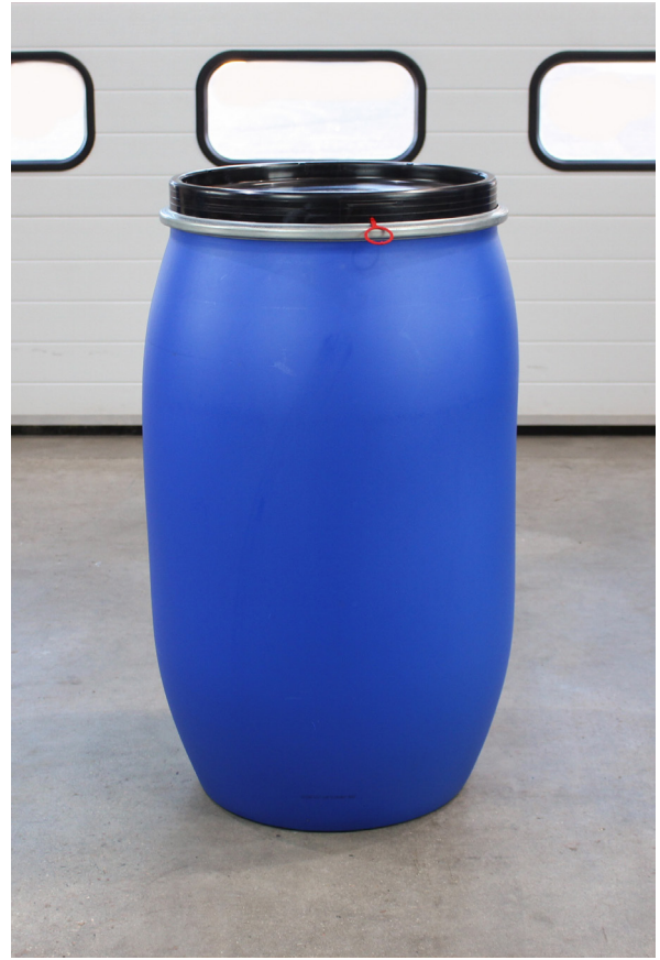
Large MAUSER - plastic - 200 litre