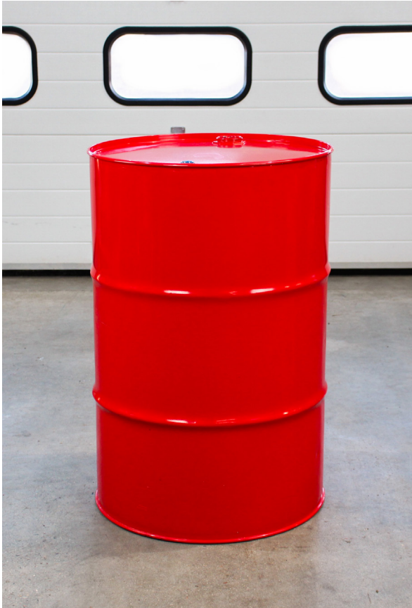
Tight-head - steel - 200 litre