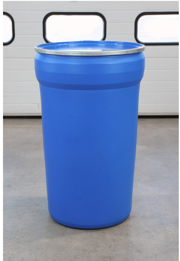
Open-top tapered - plastic - 200 litre