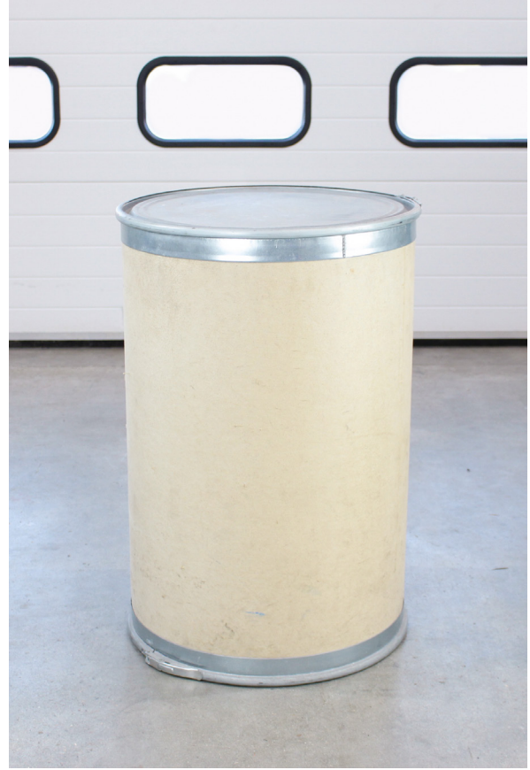
Open-top - cardboard - 200 litre