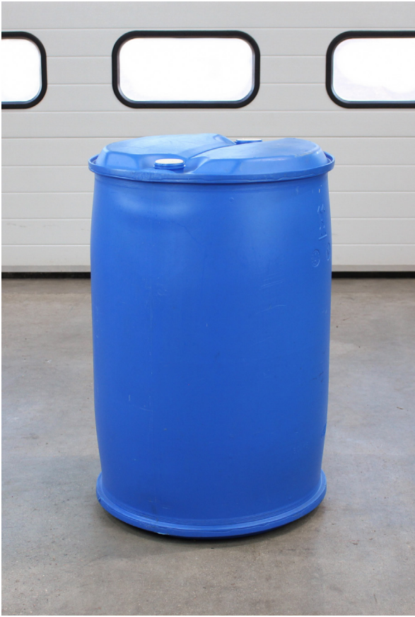
L-ring - plastic - 200 litre