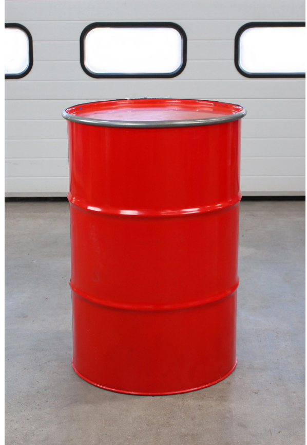
Open-top - steel - 200 litre