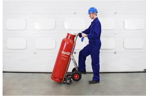
Pivot the trolley using axle