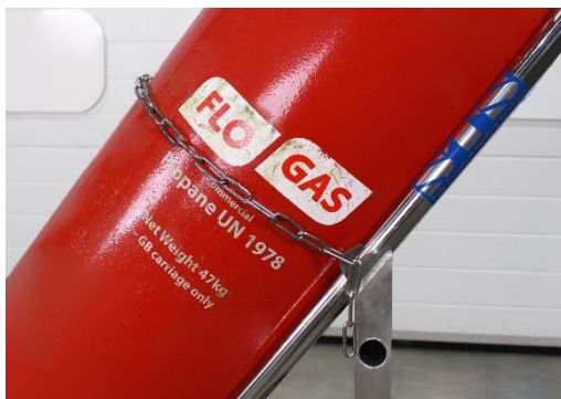
Connect safety chain