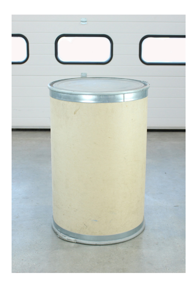
Medium MAUSER - plastic - 120 litre