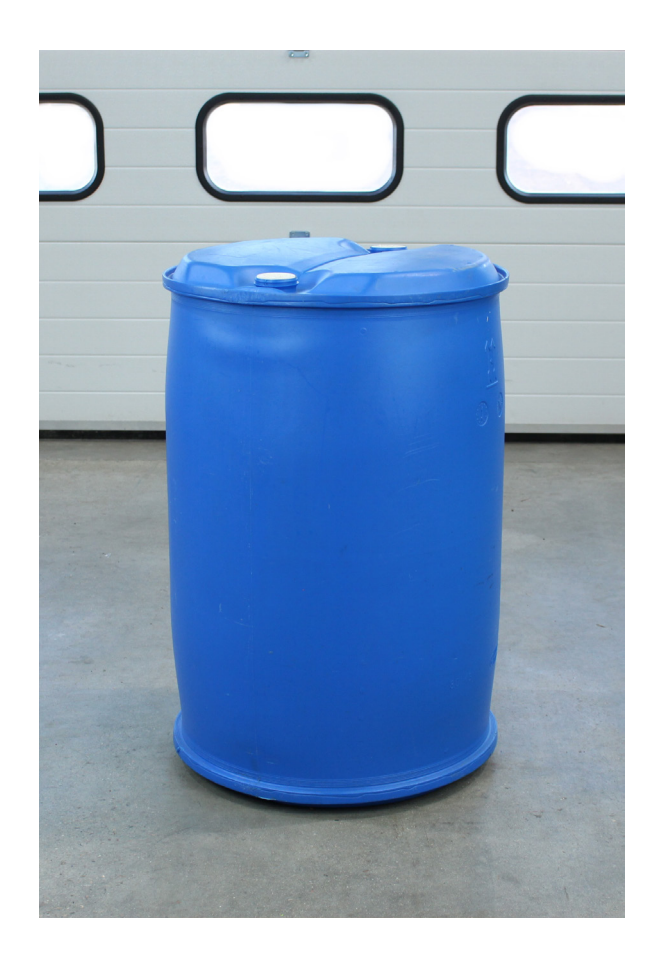
L-ring - plastic - 200 litre