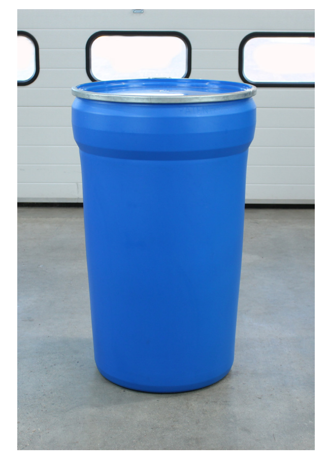
Open-top tapered - plastic - 200 litre