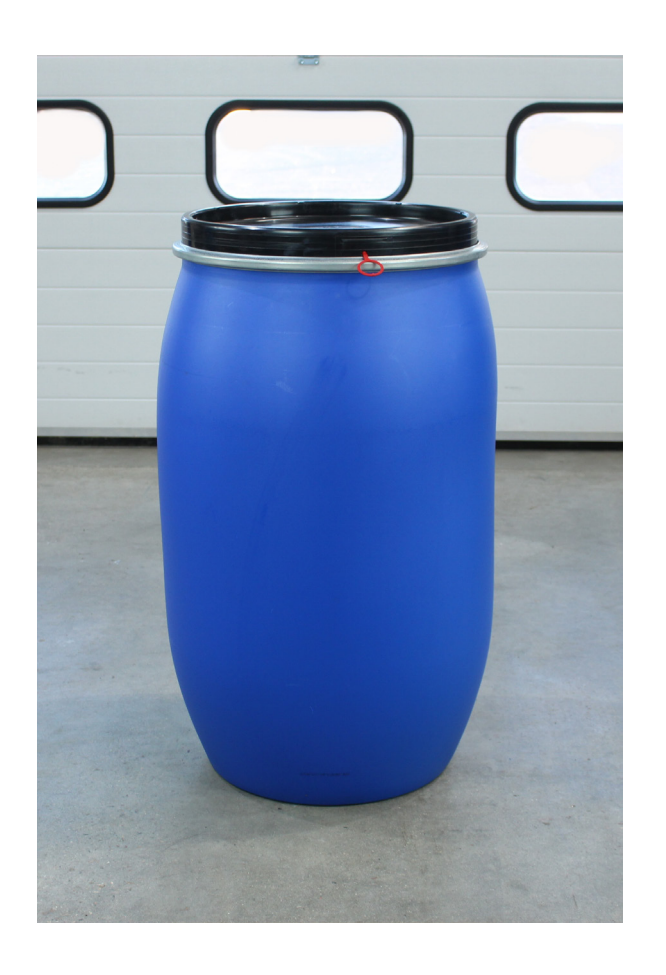
Large MAUSER - plastic - 200 litre