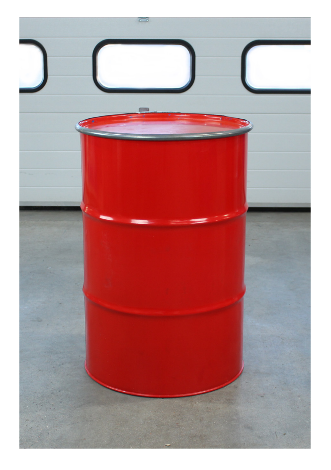
Tight-head - steel - 200 litre